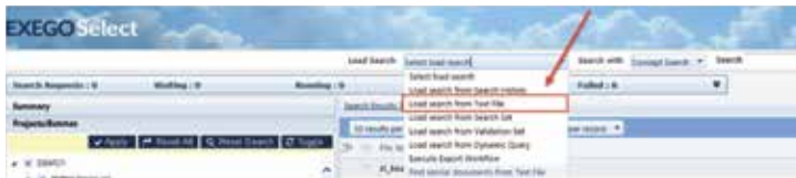
Loading CA search from TXT File